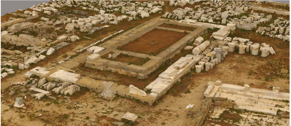
Current state of the Delos temple of Apollo